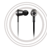
Lenovo™ 500 Extra Bass In-Ear Headphone