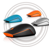
Lenovo™ 500 Wireless Mouse