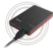
F310S USB 3.0 External Backup Hard Drive

* Example of Lenovo IdeaCentre AIO catalogue naming convention