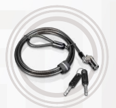
Microsaver DS Cable Lock