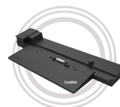
ThinkPad® Performance Dock PN: 40A50230XX