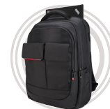
ThinkPad® Professional Backpack - Up to 15.6" PN: 4X40E77324