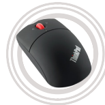
Bluetooth® Laser Wireless Mouse