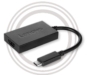
Lenovo™ USB-C to HDMI™ Adapter