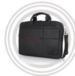
ThinkPad® Professional Backpack