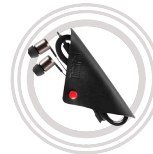
ThinkPad® Noise-cancelling Earbuds