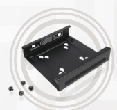
ThinkCentre Tiny VESA Mount II