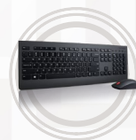
Lenovo Professional Wireless Keyboard & Mouse Combo