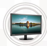
Lenovo LI2224 Monitor