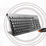
Lenovo Essential Wired Keyboard and Mouse Combo