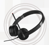
Lenovo Stereo Headset