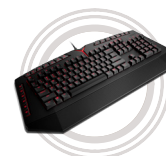
Lenovo Y Gaming Mechanical Switch Keyboard