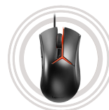
Lenovo Y Gaming Optical Mouse