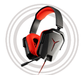
Lenovo Y Gaming Stereo Headset

* Example of Lenovo Legion catalogue naming convention