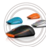
Lenovo 500 Wireless Mouse