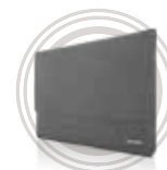
Lenovo 11"/12" Ultra Slim Sleeve