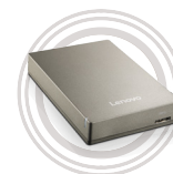
Lenovo UHD F309 USB 3.0 2 TB